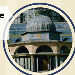
the Dome of the Chain

a free-standing dome used as a Muslim prayer house