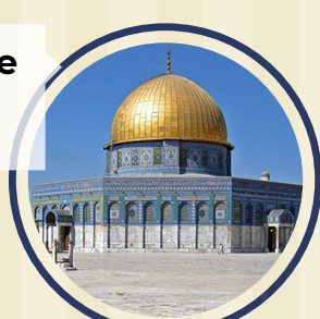
the Dome of the Rock

an Islamic shrine, considered to be Jerusalem's most recognised landmark