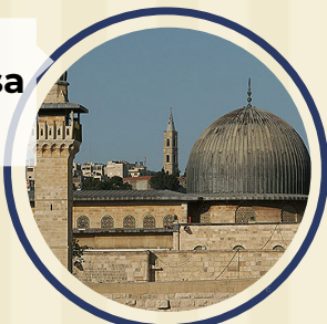
the al-Aqsa Mosque

the most important mosque in Jerusalem, hosts daily prayers and large crowds for Friday sermons